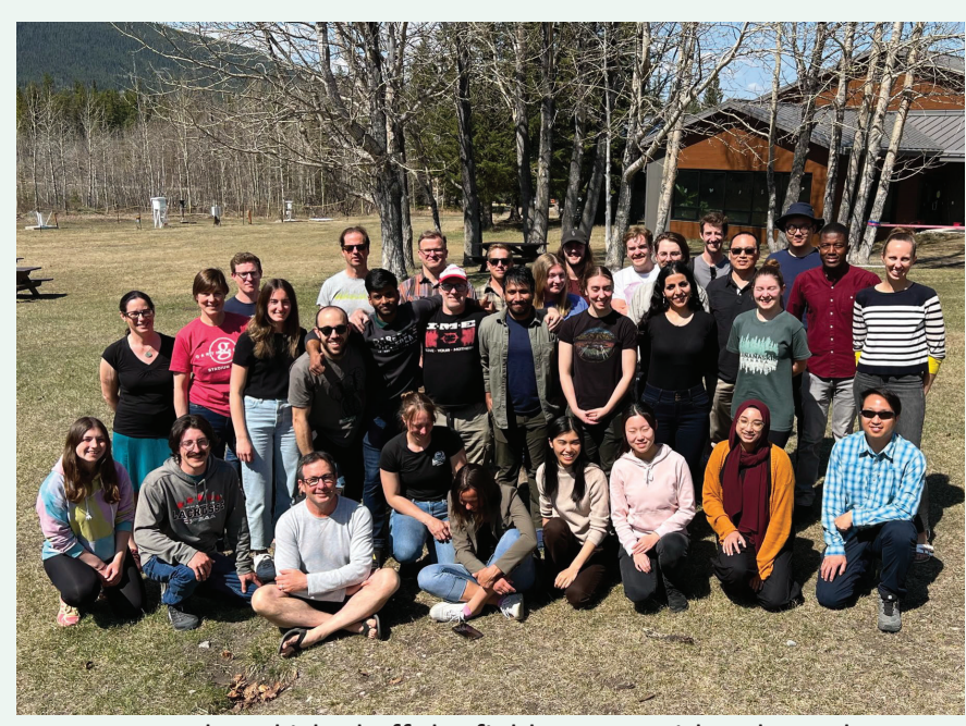
BERA researchers kicked off the field season with a three-day retreat in Kananaskis Country. We discussed our research and field plans with each other and with members of the BERA advisory committee.